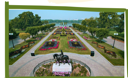
QUEEN ELIZABETH II GARDENS AND BURMESE

The Legislative Building of Saskatchewan received National Heritage status in 2005! This plaque is on the front of the building. Take a close look at the Manitoban Tyndall stone: there's fossils all over!