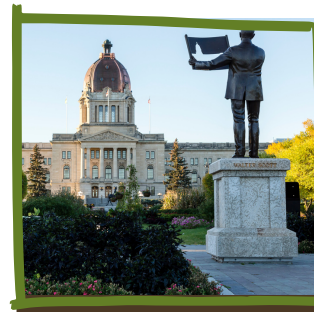
WALTER SCOTT STATUE AND LANTERN

The cornerstone of the Legislative Building was placed in 1909 by Lord Earl Grey, Governor General of Canada. Placed inside the cornerstone was a time capsule, which contained a newspaper, bank notes, a bible, and public accounts of the province.