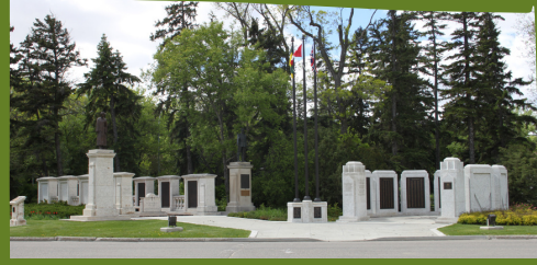
SASKATCHEWAN WAR MEMORIAL

This 256 metre-long bridge was a relief project during the Great Depression, and was dedicated by Premier J.T. Anderson in 1930 as a memorial to fallen soldiers of the First World War. It's been touted as the longest bridge over the shortest channel of water.