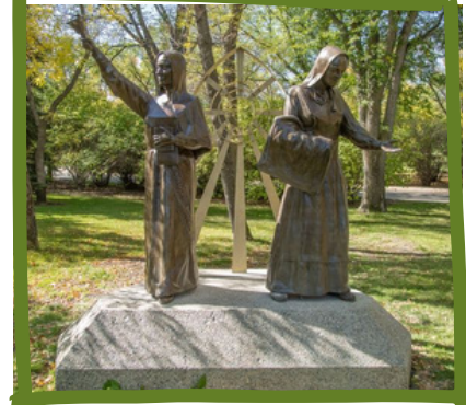
SISTERS LEGACY STATUE

This statue of nurse and teacher nuns commemorates the courage and commitment of religious women in Saskatchewan who helped in the establishment of these essential services in their communities.