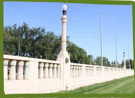
ALBERT STREET MEMORIAL BRIDGE