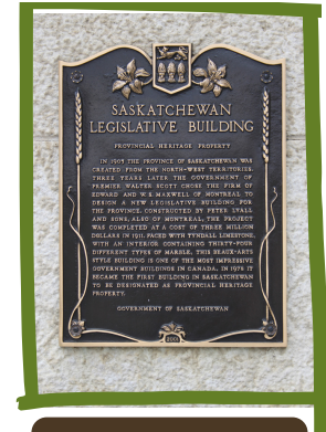
HERITAGE STATUS AND TYNDALLSTONE

The Legislative Building of Saskatchewan received National Heritage status in 2005! This plaque is on the front of the building. Take a close look at the Manitoban Tyndall stone: there's fossils all over!